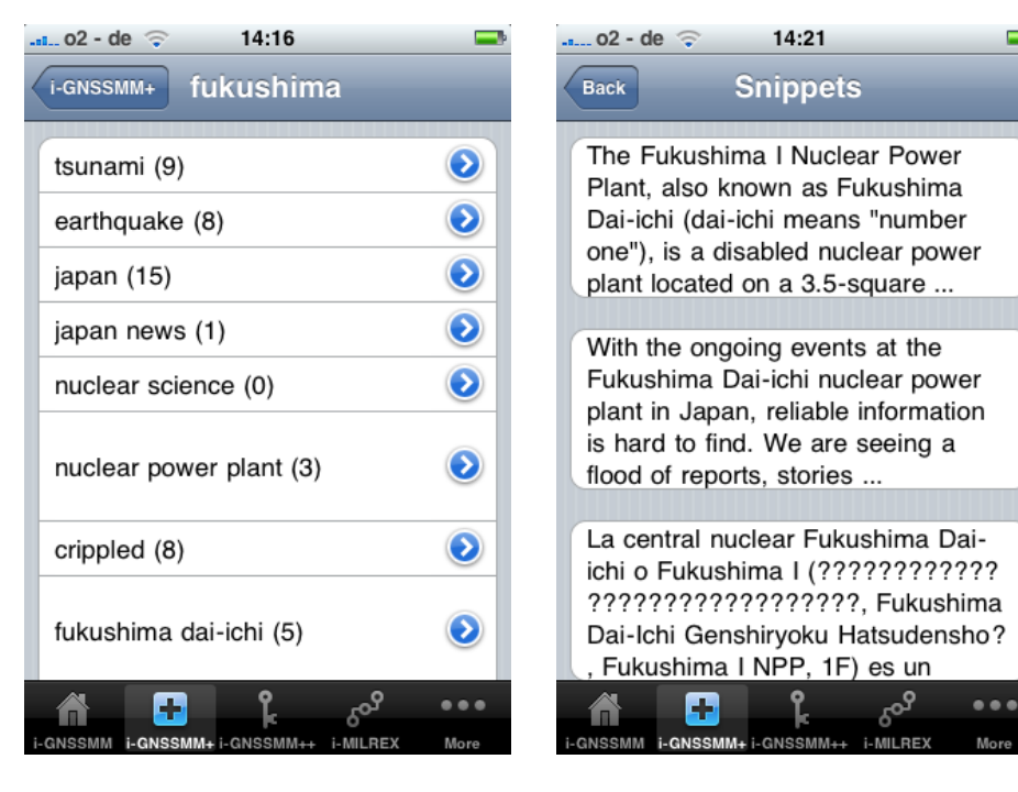
Fig. 4. The alternative representation of the topic graph displayed in Fig. 1 on the iPhone.