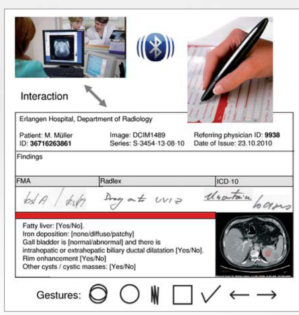
Functional principle of the interactive diagnosis form

help is given when it comes to the interpretation of what is being displayed. Semantic annotations should provide the necessary image information, and a semantic dialog system should be used to ask questions about the image annotations while engaging the clinician in a natural speech dialog. Our motivation in developing RadSpeech is the design and implementation of a multimodal dialog system for the radiologist. Dialog-based semantic image retrieval and annotation form the basis for help in clinical decision support and computer aided diagnosis.