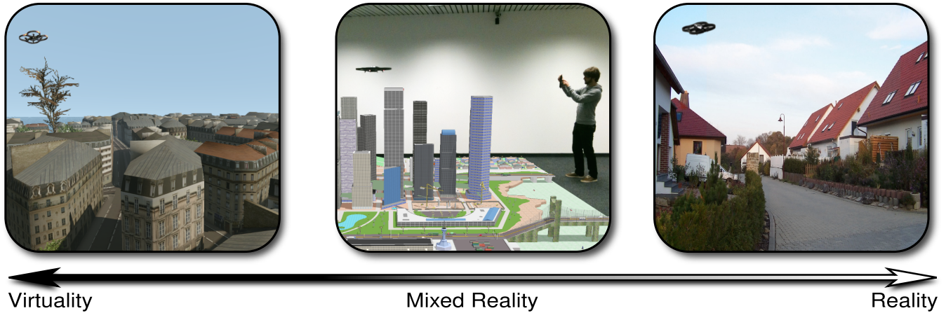
Figure 2. The mixed reality simulation in the context of the virtuality continuum: (left) virtual MUAV and environment, (middle) real MUAV and VE, and (right) real MUAV and environment.

components representing obstacles or objects whose shapes are to be reconstructed. Of course this cannot be done for huge objects like buildings but since the real sensor can only capture distances up to 7, 5 m at an aperture angle of 60^\circ this is not necessary and we can fully test it in a controlled environment. The real components still retain a representation in the virtual world. By using this approach data from the virtual and the real sensor can be obtained simultaneously. By comparing both datasets we are able to refine the simulation of the sensor.