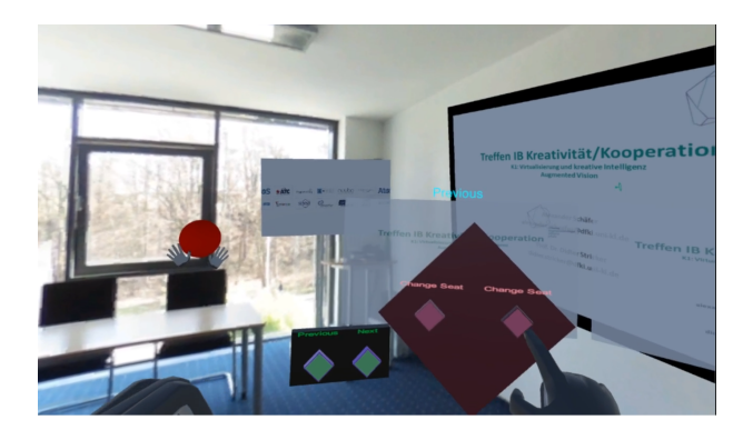
Figure 4: Virtual objects can be placed by the user in the virtual environment to enable interaction.

(see Figure 4). The fully rigged hands from the leap motion controller are streamed over network to enable users to see each others exact hand movements. For some interactions we simulated eye gaze by using a forward vector of the VR headset position in virtual space. This is used for certain gestures e.g. a swiping gesture towards the projector will change slides only when the projector is being looked at. We also use a menu which appears when the left palm is facing the VR headset. The user can grab objects from the menu and place them in the virtual world, where they expand and allow interaction (See Figure 4). Interaction possibilities include: moving to a different seat, changing projector slides and preview for upcoming slides.