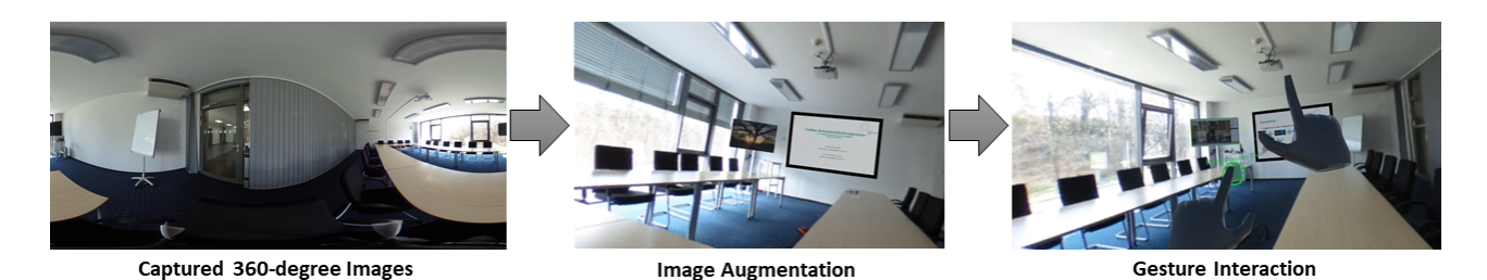
Figure 1: Our virtual reality meeting room using the proposed method.

German Research Center for Artificial Intelligence TU Kaiserslautern