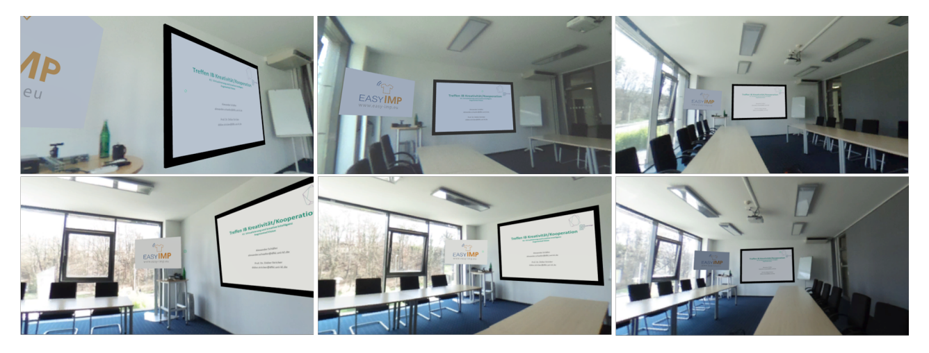
Figure 3: Multiple spherical images share a virtual TV and projector.

virtual worlds. In our case it is desired to create a realistic experience that includes all important aspects of a common meeting room. A room with multiple seats, a big table and a projector is easily identified as a meeting room. The typical way of creating such a room is to create all necessary 3D assets and properly align them. Depending on the desired amount of realism this process can be very costly and time consuming. Another option is to take photos of a room and then recreate it with 3D assets. We found that approach to be too expensive and provide a solution which is independent of the complexity of a room and still provides very high realism. This is why we chose spherical images as a source to create photo realistic virtual worlds. The visual advantage compared to traditional artificially created 3D environments is enormous, they can capture the appearance of a room with every detail in a fracture of a second. Additionally it is possible to use HDR imaging techniques for even better visual impressions. Spherical images are one of our main components in creating a virtual meeting room.