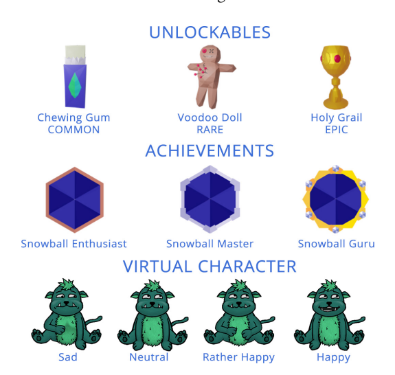
Figure 3: Visualizations of the score levels for Unlockables, Achievements and Virtual Character in Snowball Shooter.

is possible to use this input to predict Hexad user types. As such, Snowball Shooter provides some gamification elements that users can interact with (see Figure 1b): The user controls a snowball cannon and shoots snowballs at items representing each gamification element. These items are randomly positioned in each round. Shooting at an item increases the internal score of the corresponding gamification element. Similar to Cloud Clicker, the application consists of 15 rounds in which users may shoot five snowballs. It uses feedback sounds when shooting.