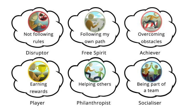
Figure 2: Illustrations and statements used in Cloud Clicker.

Similar to Triantoro et al. [45], we decided to transfer the 7-point Likert scales, which the Hexad questionnaire uses into binary choice questions in the gameful application. The whole design of the first gameful application ("Cloud Clicker") followed the process proposed by Harms et al. [12, 14] and considered recommendations and lessons learned from relevant previous work [12, 13, 17, 45], as described in the following. In Cloud Clicker, users see two statements in each of 15 rounds and then have to decide which of these two statements is more relevant to them (see Figure 1a). We selected one statement for each Hexad user type, which grasps its underlying motivation. We based the statements on the definitions given by Tondello et al. [44] and on items with a substantial factor load in the confirmatory factor analysis in the validation study of the Hexad user types questionnaire [42]. This follows the same procedure as Triantoro et al. [45] proposed to translate the Big-5 survey into a gamified counterpart.