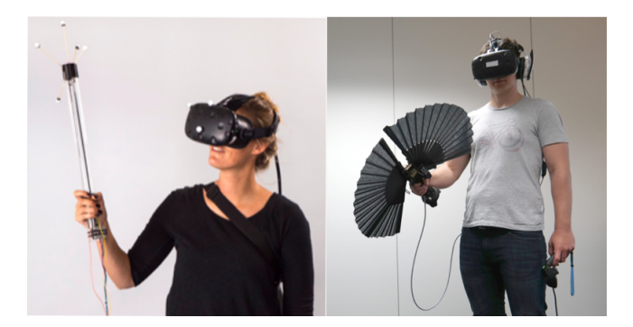
Figure 2: A great amount of past research efforts have concentrated on the development of specialized hardware, such as the haptic VR controllers Shifty [27] and Drag:on [28].

The utilization of everyday items that are likely to be found in different contexts, such as e.g., smartphones, books, paper, flowers, food, and alike, as proxies for virtual objects in VR, is an inherently multidisciplinary challenge. For seamless and immersive interaction with everyday objects in VR, research in disciplines such as HCI, VR/MR/AR, haptics, tracking, perceptual science, design, and more has to be combined. However, up to now, the research communities still lack a cohesive research agenda for advancing this domain.