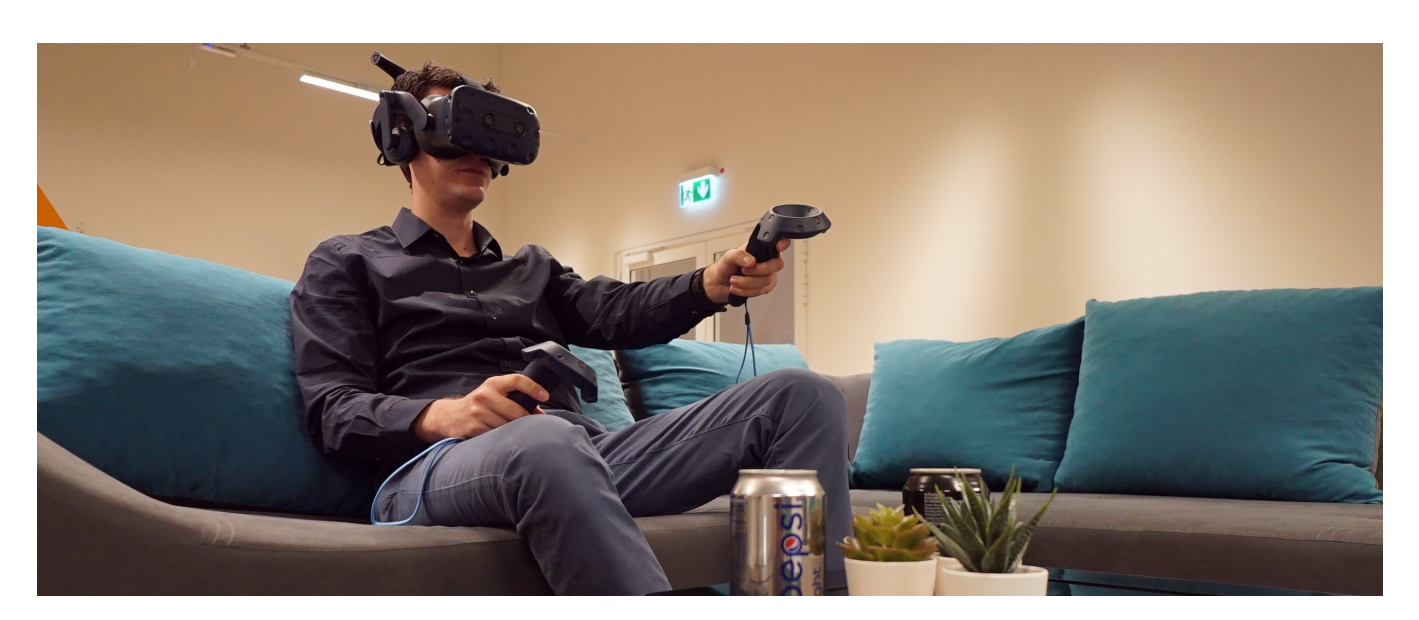
Figure 1: By understanding the composition and availability of the real world objects available to a user while in VR, such as the objects on the table in this example, they could serve as ad-hoc props to provide multi-sensory feedback and enrich interactions.

Oscar Javier Ariza Núñez ariza@informatik.uni-hamburg.de Universität Hamburg Hamburg, Germany