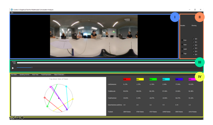
Figure 2: System ConAn: layout of user interface.

the results were not satisfying. Thus, we finally decided to use RT-GENE [34]. In addition to feeding each video frame to the model, we also input a version of the frame where the left side and the right side are wrapped together. This enables us to detect when a person moves over the edge of the video, as none of the models account for this. Moreover, as this is a single frame estimation, we then track all subjects throughout the video using a minimal euclidean distance heuristic. Finally, to reduce outliers and noise due to the single frame estimation, we apply a rolling average window with a window length of \frac{1}{3} of a second (10 frames at 30FPS).