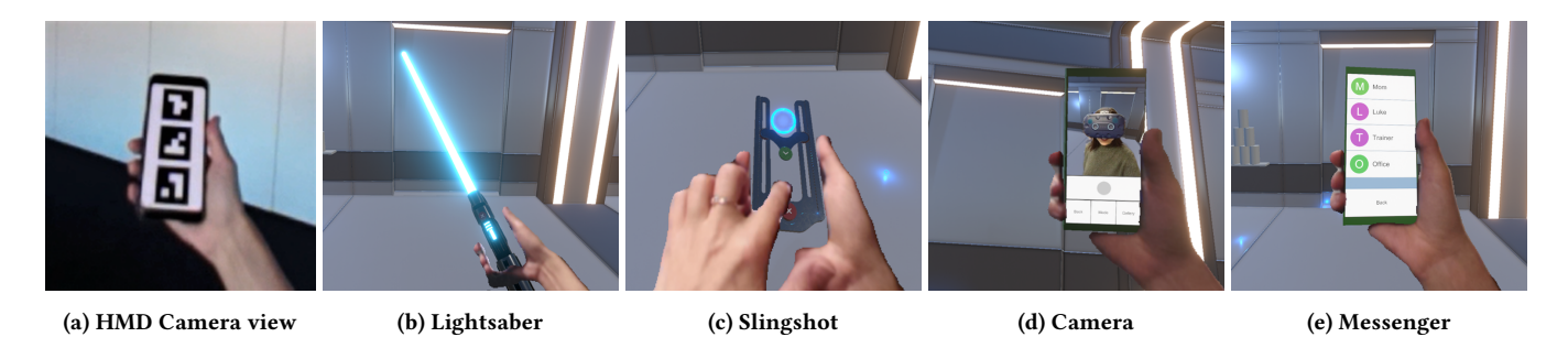
Figure 3: A smartphone is tracked using on-screen markers in (a) and represented in VR as (b) a lightsaber, (c) a catapult with haptic feedback, (d) an in-VR digital camera, and (e) a simulated messaging application.

VRySmart: a Framework for Embedding Smart Devices in Virtual Reality