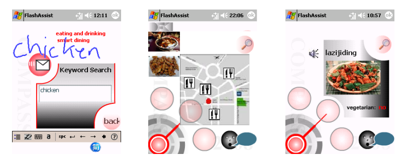
Fig. 2. Keyword search, location based results and menu navigation

If a COMPASS2008 user chooses the service Taxi Dialog Assistance, a specified service query page will appear for entering the destination name. The current location of the user will be treated as the default starting point, appearing on the screen parallel to the destination calculated by the location-based service. The user is asked to specify the category of the destination, because it can be a restaurant name, a building name, an organization or institution name. Same name belonging to different categories can have different addresses. Experiences tell us that the category information is an important resource for destination disambiguation. Furthermore, we allow users to enter the addresses of the destination as additional information. Given the destination and its category, the translation engine will look up in the bilingual dictionary. In comparison to the traditional bilingual dictionary, our dictionary contains not only the translations between terms in different languages, but also tourism relevant categories, to which they belong, such as hotel, restaurant, hospital, shop, school, company, etc. These names are related to the address and location information available in the location-based services.