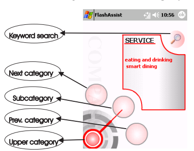
Fig. 1. Navigation in the service taxonomy

Figure 1 depicts the navigation in the service taxonomy, stepping from the general category eating and drinking to its subcategory smart dining .