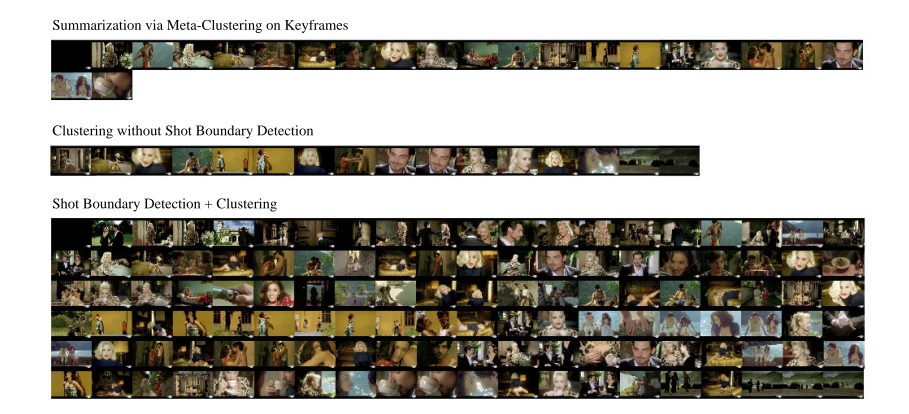
Figure 2: Result of summarization for a music video clip. First row displays "meta-clustering". Second row displays the pure clustering. Third row displays keyframes extracted by our basic method