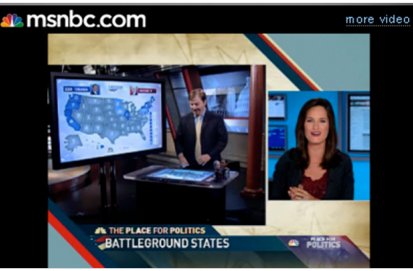
Figure 3: MS surface presented in a MSNBC election show early September 2008.

interfaces provide physical form to digital information and computation [7]. People have developed sophisticated skills for sensing and manipulating their physical environments. However, most of these skills are not employed in interaction with the digital world today. Surprisingly many applications using a multitouch enabled surface fall well short of utilising the full potential that multi-touch interaction has to offer, and are contributing to the impending phases of "Disillusionment".