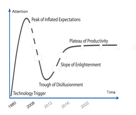
Figure 2: Gartner's five phase hype cycle: Adapted for multi-touch based on a diagram by Jeremy Kemp [8].

preserving the monarchy and maintaining the continuity of the State.