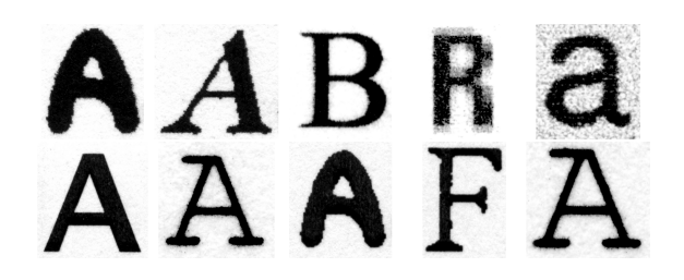
Figure 1. Sample letter from different inkjet printouts (top) and laser printouts (bottom). Laser printed letter typically show sharper contours than inkjet printed ones.