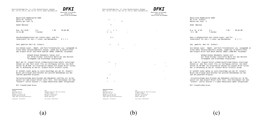
Figure 7. Example of classifier visualization: A letter, that is composed of both laser and inkjet print, is classified using the proposed system. The left image shows the original scan in reduced resolution; the center and right images show the red and green color channel of the classification output. The header and footer have been identified correctly as laser (b). The text body shows few errors, but is mainly correctly identified as inkjet (c). In the software GUI, the output is color coded instead of showing the color channels separately.

companies, who have to handle a large amount of incoming paper documents, e. g. insurance companies.