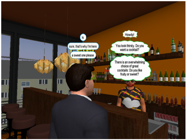
Figure 2: Our bartender NPC in his bar in Twinity

We chose these two characters not only because of their value for the Twinity application but also for our research goals. They differ in many interesting aspects. First of all, the furniture sales agent is controlled by a complex task model including ontology-driven and data-driven components to guide the conversation. This agent also possesses a much more fine-grained action model, which allows several different actions to cover the potential conversation situations for the selling task. The bartender agent on the other hand is designed not to fulfill one strict task because his clients do not follow a specific goal except ordering drinks. Our bartender has the role of a conversation companion and is able to entertain clients with his broad knowledge. Thus, he is allowed to access to several knowledge bases and is able to handle questions (and later conversations) about a much larger domain called the "gossip domain" which enables conversation about pop stars, movie actors and other celebrities as well as the relations between these people. In order to achieve a high robustness, we integrate a chatbot into the bartender agent to catch chitchat utterances we cannot handle.