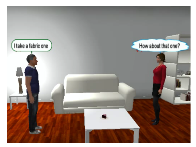
Figure 1: The furniture sales NPC selling a sofa

alog with the NPC, the preferred objects are then selected and directly put into a location in the apartment, which can be further refined with the user interfaces that Twinity provides.