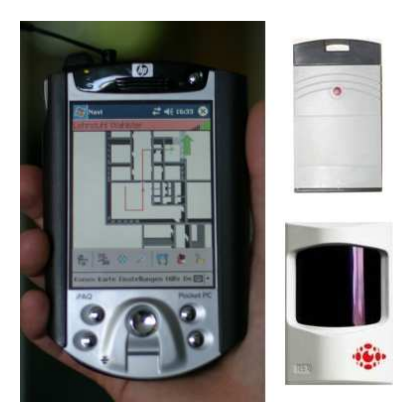
Fig. 2. iPAQ with attached RFID sensor and built-in infrared sensor (left). Active RFID tag and infrared beacon (right).

considered as raw sensor data because it does not contain the position of the detected devices. An application that wants to use this data has to infer the position out of these lists.