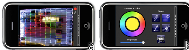
Figure 4. To keep the drawing canvas as large as possible (a), users can switch to the tool palette (b).

Our first application allows users to solve a 15-puzzle on the facade. Eight pixels (i.e., 2 by 4 windows) are representing one tile of the puzzle. Tiles can be shifted by tapping on a tile next to the missing one. However, the facade’s low resolution did not allow for clearly showing division lines that are important to identify tiles (see Figure 3a). We decided to allow users to superimpose these lines on the mobile device to allow for tile identification (see Figure 3b). As our tiles only have 8 pixels in total, it is hard to identify a tile’s correct location. Users can peek at the solved puzzle by requesting a preview (see Figure 3c). We decided to show the preview locally so that others are not distracted.