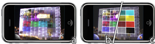
Figure 3. On request, the original video image of the puzzle (a) is augmented with a grid (b) or a preview (c).

Aside from determining the spatial relationship of mobile devices, the server stores individual content for each user as image data which (on request) can be transferred to the mobile device. In some cases (i.e., directly superimposing individual content), the system also distorts the content for correct alignment with live video. This is done by using the inverted transformation matrix (i.e., homography) calculated during the detection process. Once the image is sent to the mobile device, it is overlaid on the live video image.