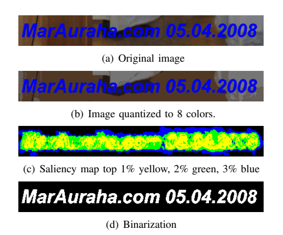
Figure 2: Text segmentation for image region

The final bounding boxes are shown in the Figure 3 and marked with a red outline.