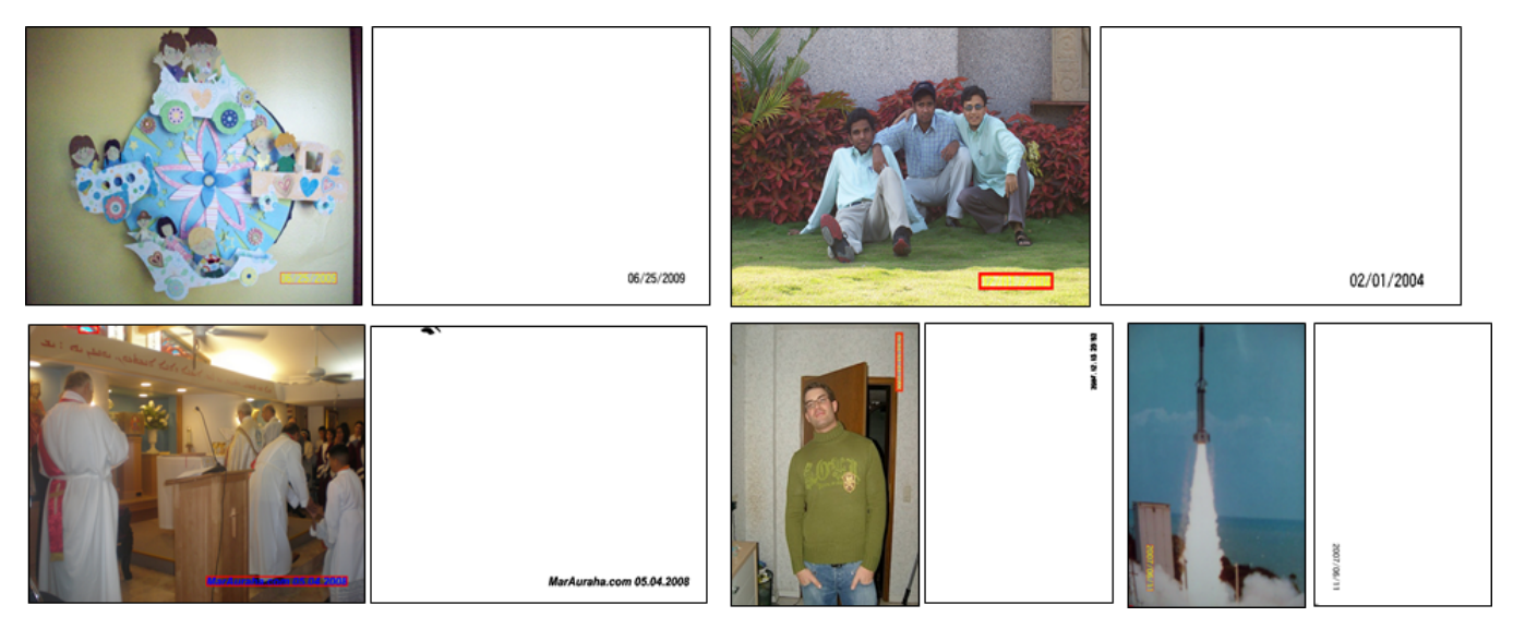
Figure 3: Text Location, Segmentation Results