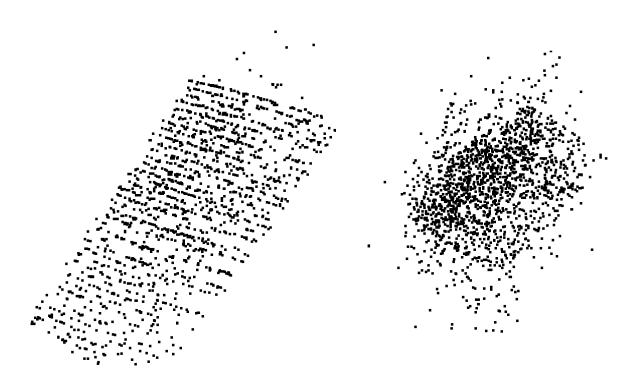
Figure 3. 3D reconstruction of book page without RANSAC. Left side shows the proposed method. Right side shows default matching.

To measure the improved reliability of feature matching, we consider the percentage of correct matches remaining after RANSAC. A fundamental matrix will be computed using available matches and outliers are removed which does not satisfy the epipolar constraint as given in Equation 3. In our experiments, the probability that the fundamental matrix is correct given the matches is set to 0.99 and the maximum