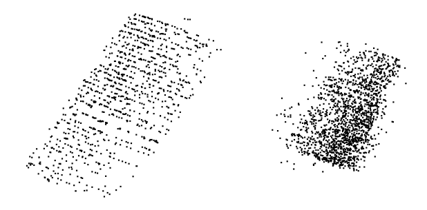
Figure 4. 3D reconstruction of book page with RANSAC. Left side shows the proposed method. Right side shows default matching.

distance of a point from its corresponding epipolar line is set to one pixel.