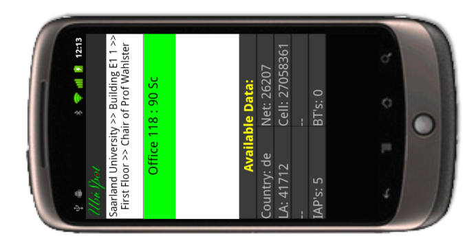
Figure 2. Smart phone running UbiSpot

using a dashboard-like metaphor. Each change of the environment detected by sensors will be transmitted via events to the EBS server, which will broadcast them to this dashboard component, which itself is registered as a client. The dashboard component aims at monitoring and controlling the services I/O behavior, which can be detected in the instrumented environment. Apart from the visual representation itself, interaction in this visual representation should have an influence on the real world, e.g., if the user changes a parameter in the virtual model, the corresponding change is reflected in the real environment. This bi-directional communication from the real world to a virtual model and vice versa is referred to as Dual Reality [5]. The dashboard component should also be implemented as a generic interface to enable the inclusion of simulators that can influence the virtual representation but also the real world [4].