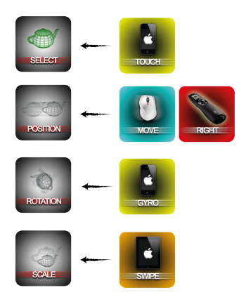
Figure 2: Example device configurations for Object Editor.