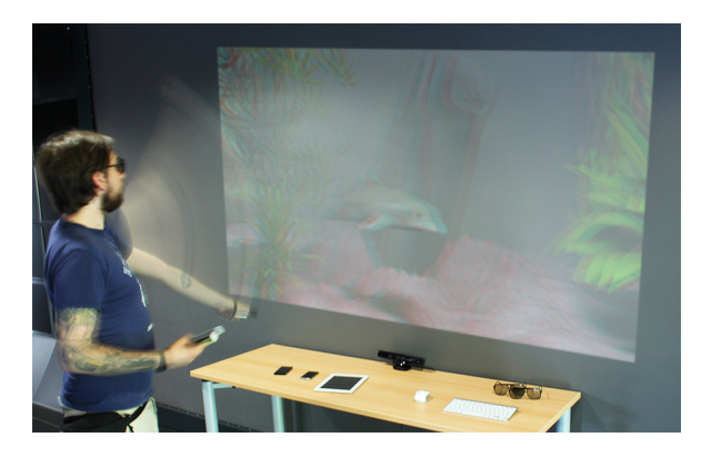
Figure 1: Sensor-based mobile interaction with stereoscopic fishtank user interface.

In the last years there has been an increasing interest in 3D related technology, e.g., 3D movies, augmented reality applications and gaming. Although 3D interaction has been a long research tradition, recent 3D technology lacks of natural interaction. Novel input devices such as interactive tabletops, smartphones and depth sensors have the potential to close this gap. Nevertheless, there is still research needed how these devices can be efficiently used as input for 3D user interfaces (3D UIs).