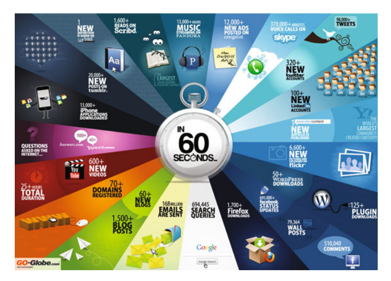
Fig. 1. Things That Happen On Internet Every Sixty Seconds. By Shanghai Web Designers, http://www.go-gulf.com/60seconds.jpg.

In practice, however, the data revolution is in its infancy, and there is still a big gap from the big data to the big picture, i.e., from the opportunities to the challenges. The reasons behind the gap are the following three.