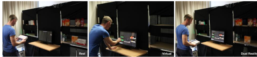
Fig. 1. Environment in the real, virtual and Dual Reality conditions

The schematic setup is shown in Figure 2 and is the same for all three conditions. The worlds are designed exactly the same way, illustrated in Figure 1. For the virtual version, we used a 3D scene displayed on a 2D touchscreen for representing a virtual version of the real world.