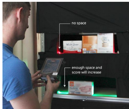
Fig. 3. Lights indicate available space and score

The subject uses real products and shelves to accomplish the task. We implemented several assistance systems, which should help the subject in achieving a good score, without reducing the cognitive effort too much. We displayed the actual score as well as the change with respect to the last step on the screen between the shelves, giving the subject a hint on whether his actions were going in the right direction. Additionally, we installed LED lights in different colors on each shelf of the left shelf unit (target shelf). As soon as the subject touches a product or holds it in his hands, the LEDs are turned on indicating if there is not enough space to place the product (red light); the space is sufficient, but the score would decrease (yellow light); or the space is sufficient and the score would increase (green light) after placing the product (see Figure 3).