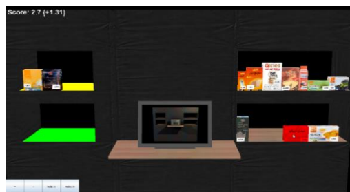
Fig. 4. Setup in the virtual world condition

We designed the virtual world to be as similar as possible to the real world in order to be comparable. Therefore we decided against a 2D representation and used a 3D view instead. A screenshot of the virtual model is shown in Figure 4. For additional functions such as switching views between shelves or zooming, several command buttons are displayed in the lower left corner of the interface.