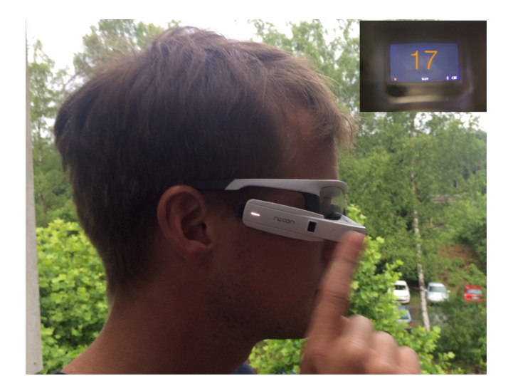
Figure 7: RPE Interface for running using the Recon Jet smart glasses. The swipe forward increases the RPE level, while a swipe with finger backwards decreases it.