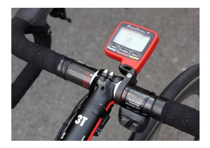
Figure 5: An RPE interface mockup for cyclists

In cycling, our design is inspired by the physical buttons used for electronic gear shifting systems, such as Shimano Dura Ace Di2 (see Figure 5). These have a natural affordance though clearly communicating the cyclist an up and down analogy. Feedback about the selected RPE is provided on display mounted at the center of the handlebar. To initiate an RPE measurement, the athlete presses either the down or up arrow and the minimum RPE gets displayed. To increase the RPE number, it is possible to hold down a button for a fast automatic increment or decrement. Thereby, the user can make a rough selection of the target RPE range, followed by a fine grained single-button-press choice. The design decision for physical buttons, which provide tactile feedback, is motivated by the necessity to tightly hold the handlebar at high intensities. Going uphill, cyclists tend to apply reaction forces at the handlebars when they remained seated on the saddle [5]. Therefore, they cannot take a complete hand away from the handlebar to interact, e.g., with a touchscreen mounted at the handlebar. Thesee