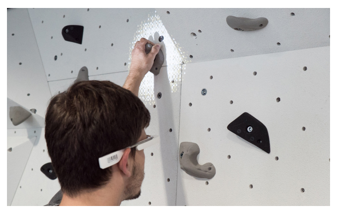
Figure 2. During the ascent, the trainee sees himself from a third-person perspective through the Google Glass.

This work is inspired by research from sports psychology and motor learning and contributes to the design and evaluation of video feedback techniques in HCI and sports. In particular, the proposed approach goes beyond existing video feedback and expert modeling techniques by investigating an in-