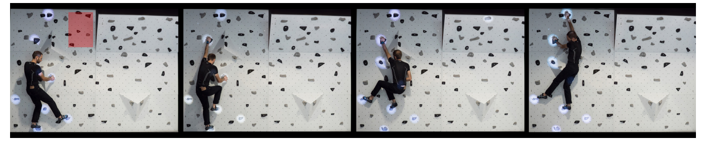
Figure 7. Outside Edge. The climber rotates the hips so that the hip opposite the pulling hand is turned into the wall. The red rectangle depicts the fixed position of the projected display.