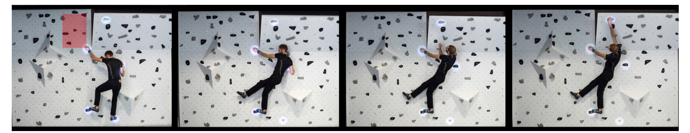
Figure 4. Flagging is a climbing technique that helps the climber to keep her balance when only having holds for one side of the body. The red rectangle depicts the fixed position of the projected display.