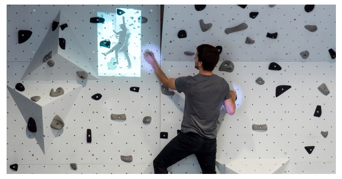
Figure 1. The trainee sees himself from a third-person perspective and can use the augmented video stream of the experienced climber to adjust his body position.

Permission to make digital or hard copies of all or part of this work for personal or classroom use is granted without fee provided that copies are not made or distributed for profit or commercial advantage and that copies bear this notice and the full citation on the first page. Copyrights for components of this work owned by others than ACM must be honored. Abstracting with credit is permitted. To copy otherwise, or republish, to post on servers or to redistribute to lists, requires prior specific permission and/or a fee. Request permissions from Permissions@acm.org. ISS '17 , October 17–20, 2017, Brighton, United Kingdom © 2017 Association for Computing Machinery ACM ISBN 978-1-4503-4691-7/17/10...$15.00 https://doi.org/10.1145/3132272.3134119