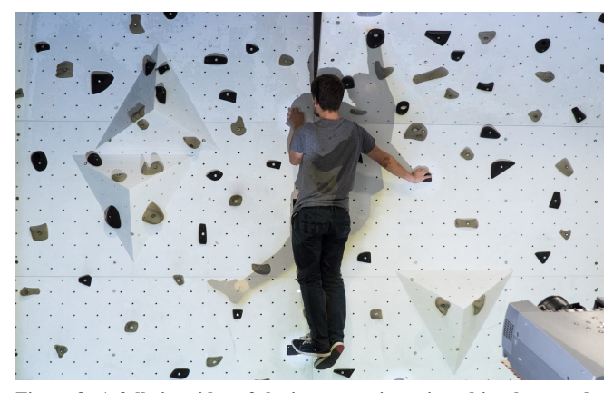
Figure 8. A full-size video of the instructor is projected in-place on the climbing wall. The trainee has to mimic the body posture of the projection.

to understand what the trainer is saying" (P1); "Seeing yourself is very helpful. It's the same thing when doing ballet in front of a mirror" (P2); "The video feedback is better because I understood faster what to do" (P7); and for its independence from the availability of an instructor: "You do not need an expert at hand" (P3); "I could do this whenever I wanted without an expert by hand" (P4); "You don't depend on an expert" (P8). Social aspects also play a role "Maybe some people would feel more comfortable with video feedback because they don't want to embarrass themselves in front of a trainer" (P10); "I can climb it my own pace and don't feel stressed because I am being watched" (P12). A drawback of the video feedback was that some participants mentioned problems in correctly perceiving the demonstration of the expert: "I need to understand the visualization. I see the visualization, I think to know what I need to do, but this might be totally wrong" (P2); "I think the video feedback is not suited for real novices but beginners who already have a rough understanding of how to move on the wall" (P6). Another problem with the video feedback techniques was the quality of the visualization: "Body rotations were hard to recognize because of missing contrast" (P2); "Missing depth perception" (P4).