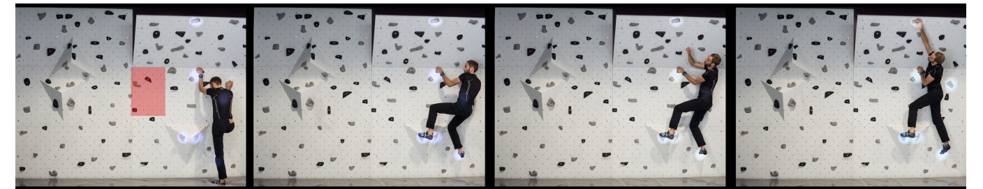
Figure 6. Twistlock. By rotating around the climber's body axis and simultaneously locking the grabbing arm, she can reach a high hold more easily. The red rectangle depicts the fixed position of the projected display.