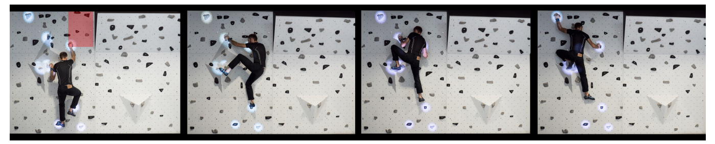
Figure 5. Rockover is a climbing technique in which the climber rocks onto a hold by moving sideways instead of upwards. The red rectangle depicts the fixed position of the projected display.