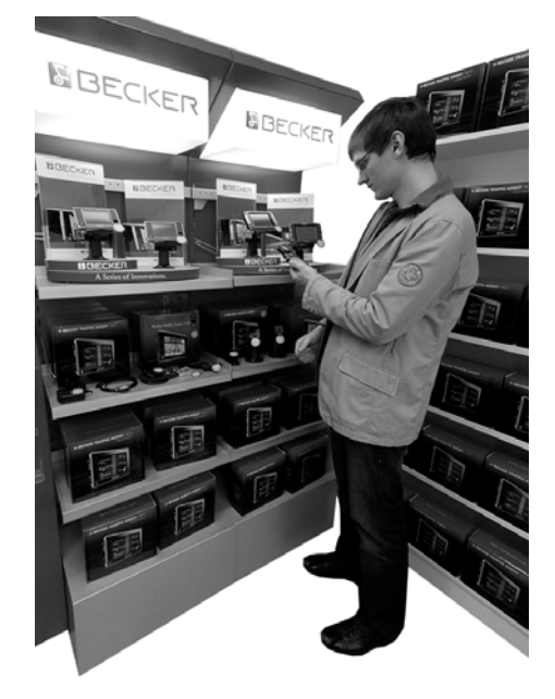
Figure 2 Consumer using an RFID-enabled mobile device within a retail store selling mobile navigation units (continued)

In addition, the subjects of groups B, D and F were asked how much of the product's price they were willing to pay for the review in order to provide first guidelines for pricing considerations. Here, we chose a relative approach to identify participants' willingness to pay, because the value of information is highly subjective (Raban, 2007; Raban and Rafaeli, 2006).